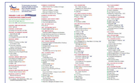
Brochures (condensed participant listing)